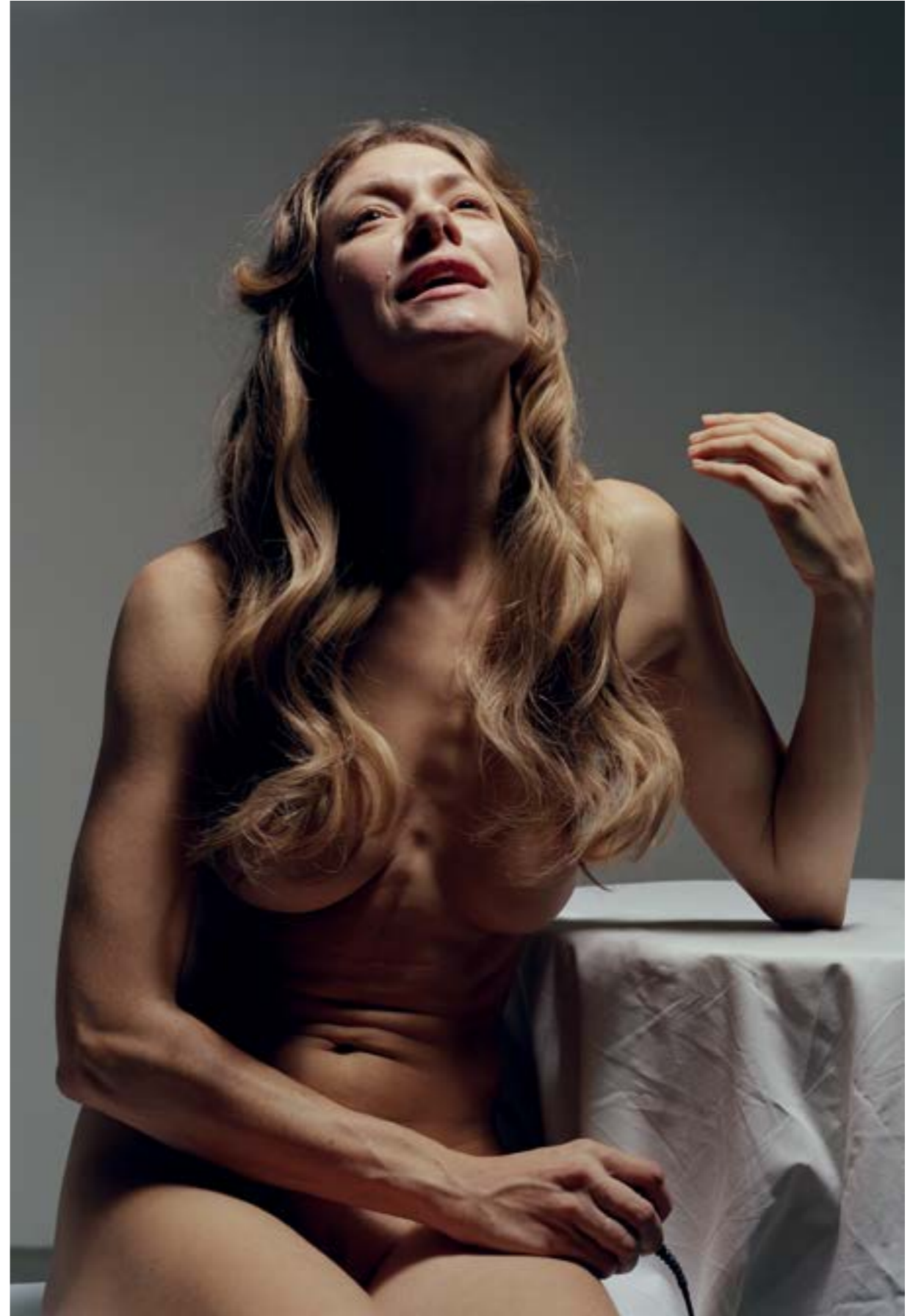
La Lacrima (Maddalena), 2011