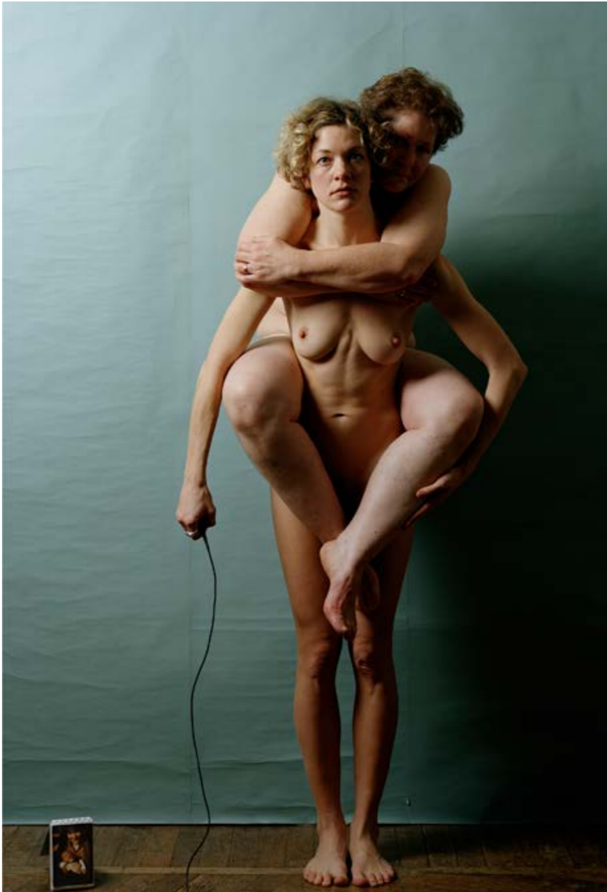
Mutter und Tochter_A, 2010