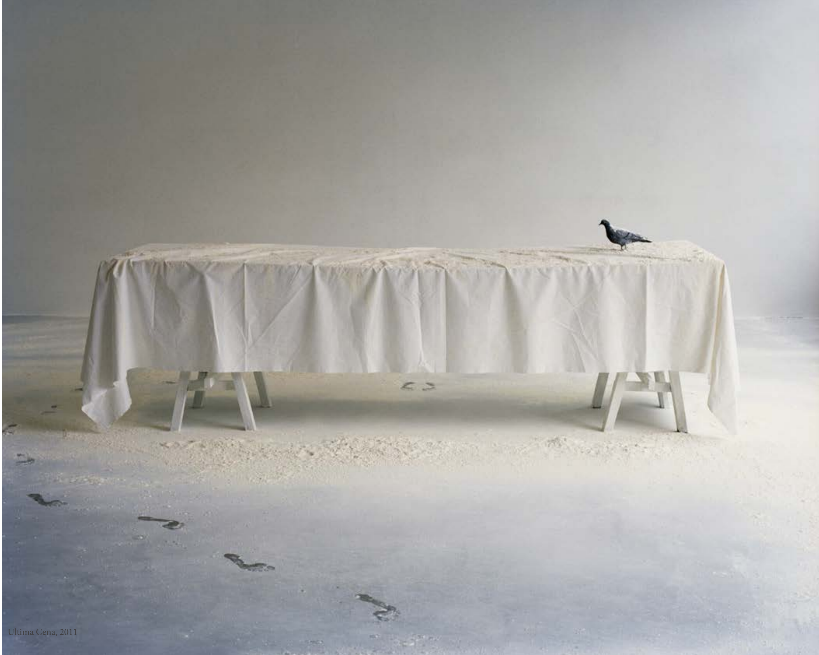
Ultima Cena, 2011