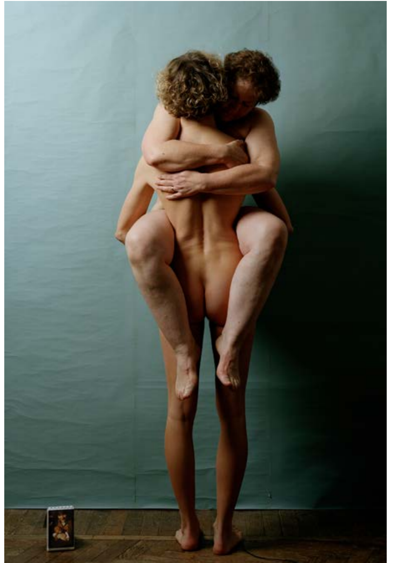
Mutter und Tochter_B, 2010