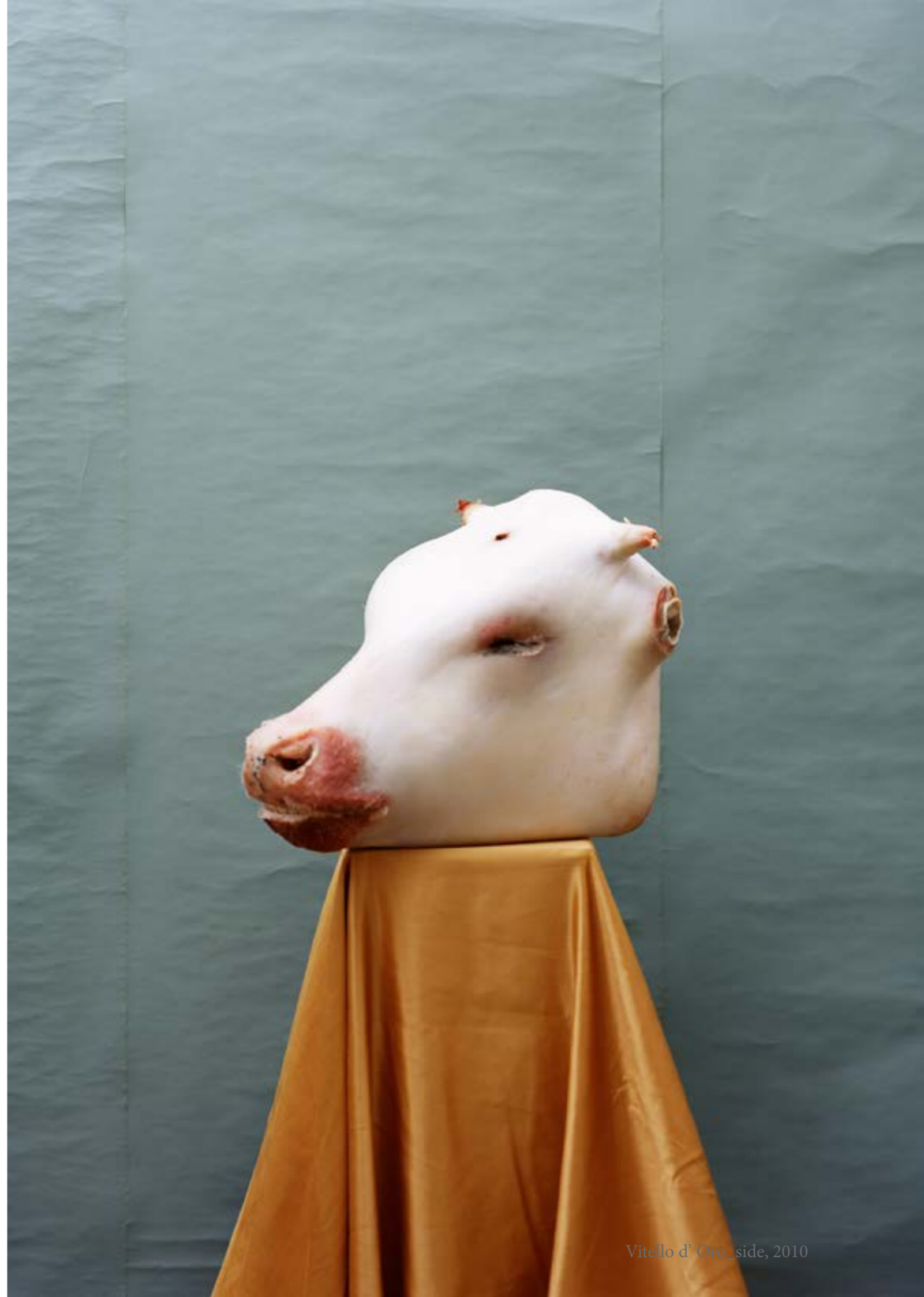
Vitello d' Oro_side, 2010