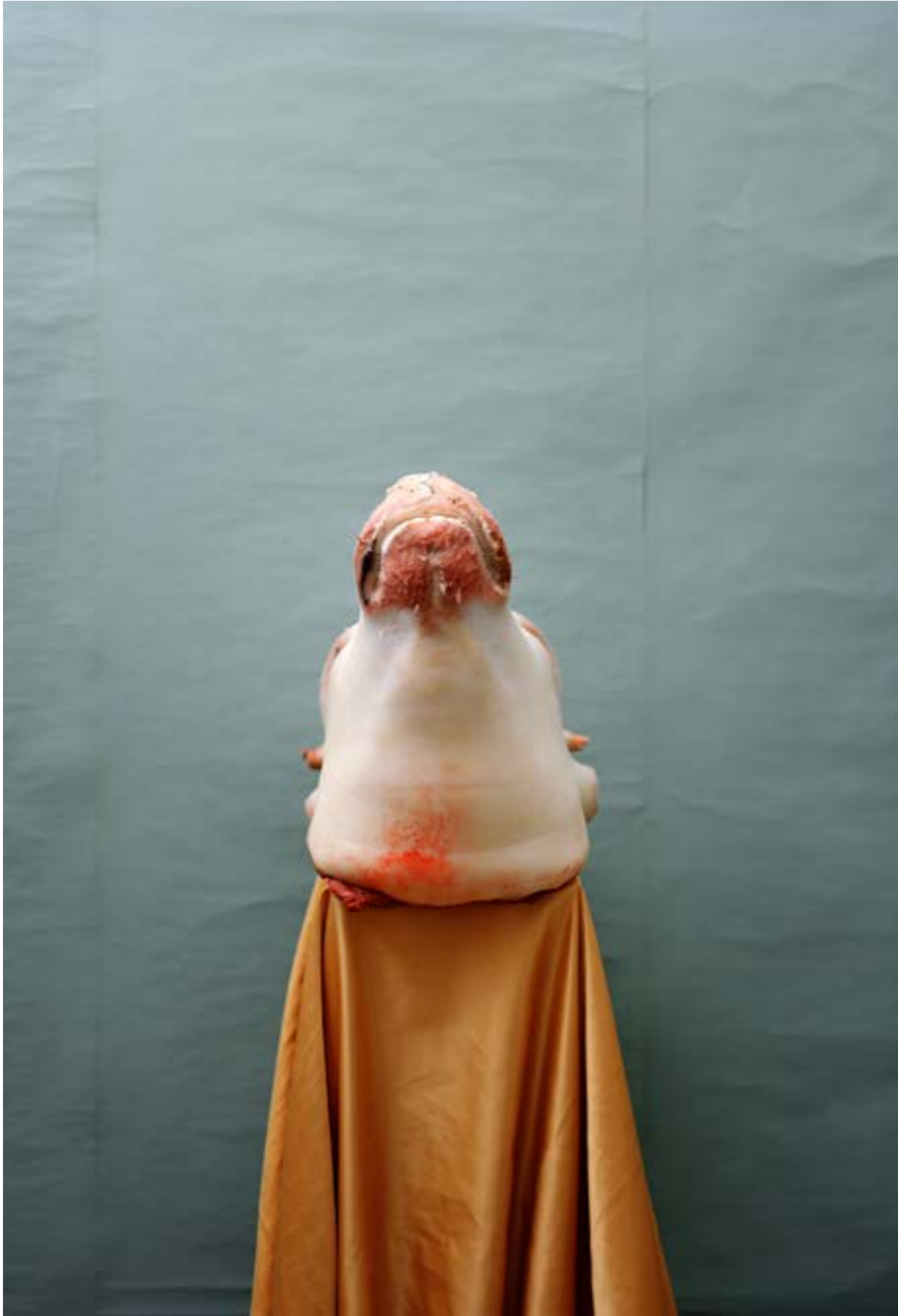
Vitello d' Oro_canto, 2010