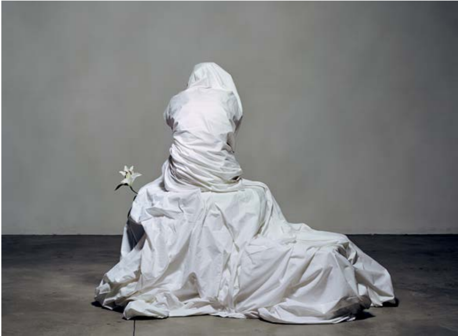
Melancholie wachsend, 2011